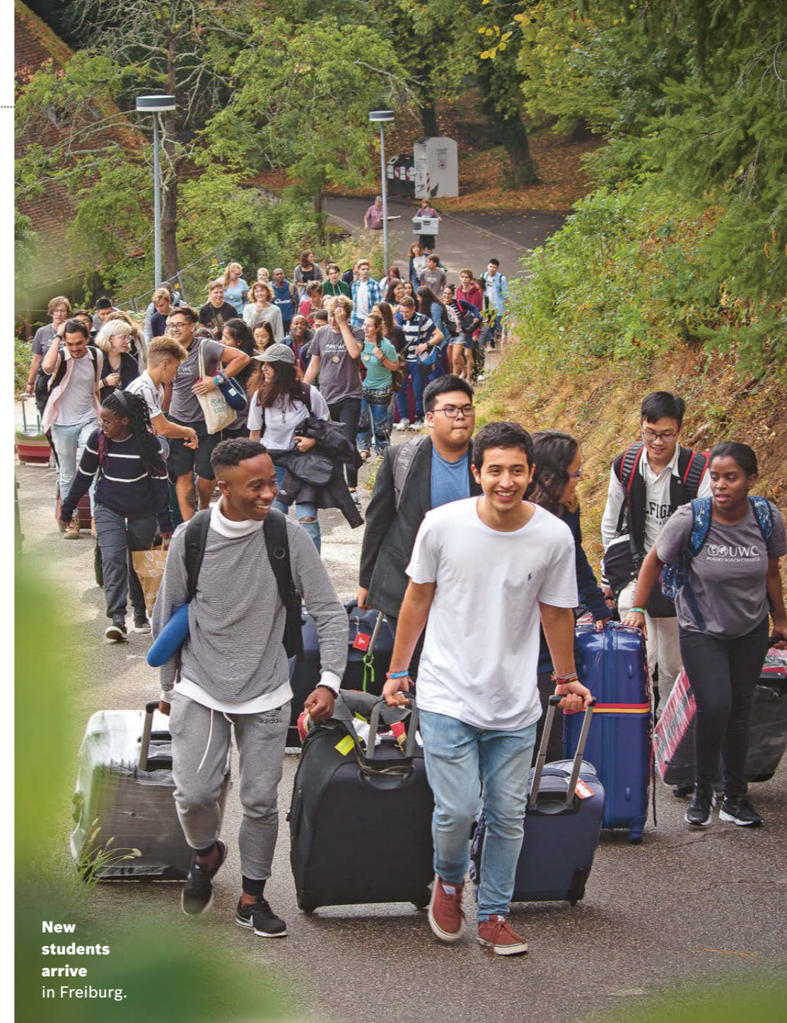
New students arrive in Freiburg.