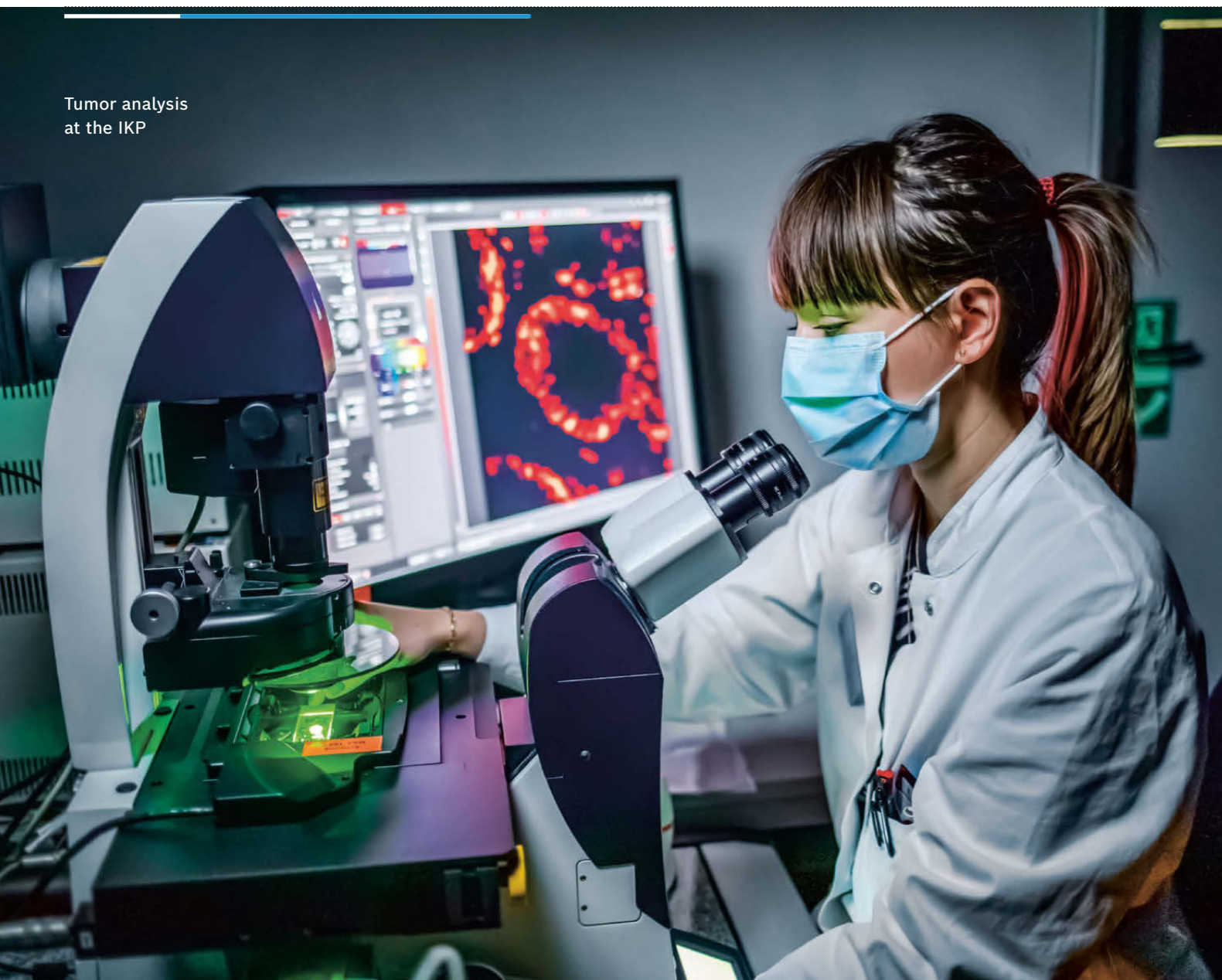
Tumor analysis at the IKP